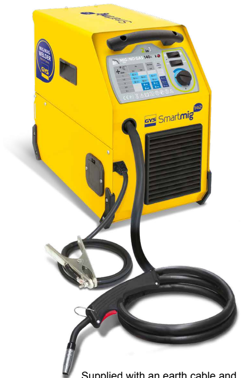
Supplied with an earth cable and a 2.2m fix torch.

Constant running fan protects unit against overheating.